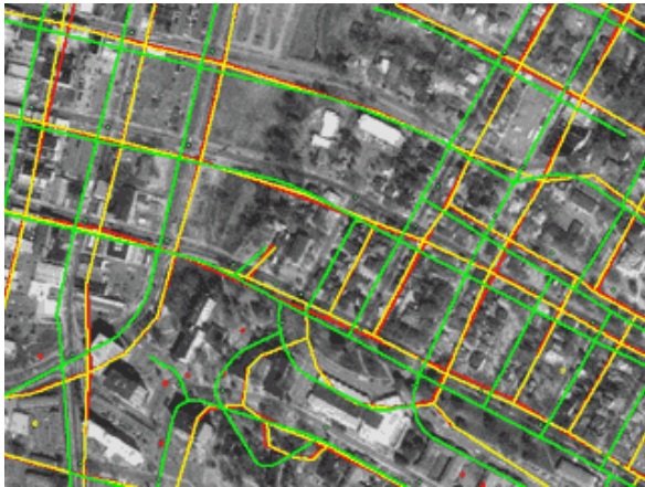
Land Form and Rainfall Maps of our Region

Three, we have received two companion Growing Greener Grants. The first was sponsored by Murrysville to look at municipal operations with an eye towards doing things better, cheaper, and with fewer negative environmental impacts. The second was sponsored by TCWA and is looking at ways for municipalities to work cooperatively across the watershed to reduce non-point source pollution and stormwater-related damages.