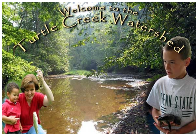
New Website Homepage at tcwa.org

We are constructing a new and improved website at www.tcwa.org (click on the yellow New Website link).