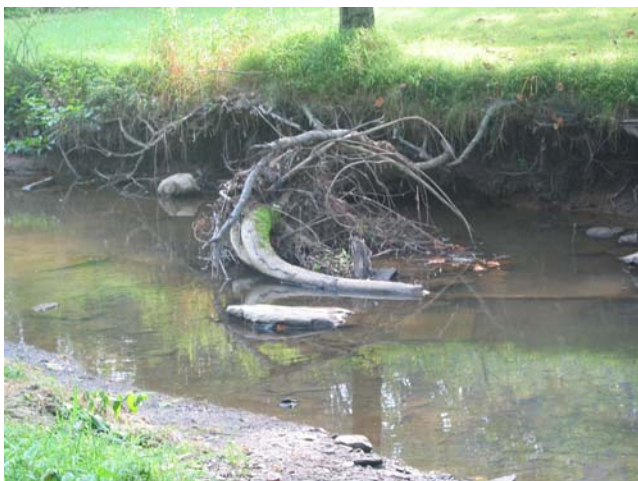
Erosion, Sedimentation, Streambank Destabilization and Low Water Table

We will look more at the numerous consequences in our Fall 2006 edition.